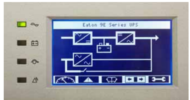
Large LCD graphically displays UPS status and offers easy access to options and settings

1. Due to continuous product improvements, program specifications are subject to change without notice.